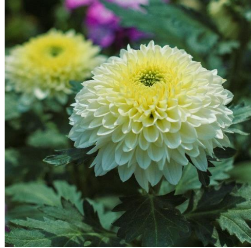
Chrysanthemum Vanya White

A decorative-type flower with an unusual spherical shape, with petals that are white at the edges, but yellow towards the centre. This is a new variety making its Southeast Asian debut at Gardens by the Bay's Chrysanthemum Charm floral display.