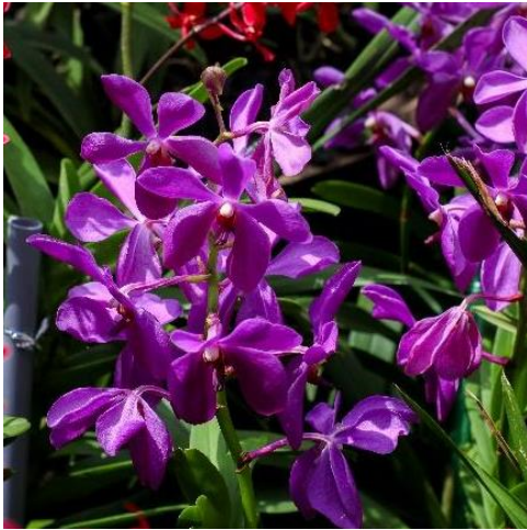
Aranda Noorah Alsagoff

A remarkable Singapore hybrid registered in 1972, regarded for its vigorous and free-flowering nature, and the exceptional substance of its flowers. Its ancestral species originate from the region of Brunei Darussalam, Indonesia, Malaysia, Singapore and Thailand.