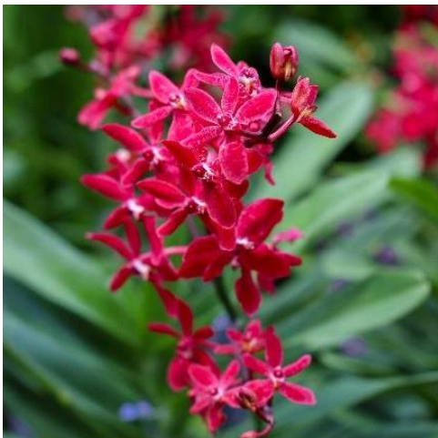
Renanstylis Bangkok Beauty

This beautiful moth orchid has a long inflorescence of large, white flowers. The origins of the hybrid's ancestor species can be traced to Brunei Darussalam, Indonesia, and Malaysia. It is reminiscent of Phalaenopsis amabilis , one of the national flowers of Indonesia