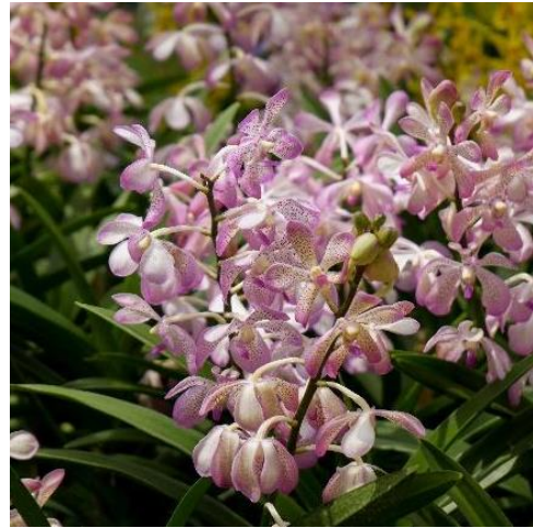
Aranda Pure Heart

A white orchid with pink edges and mottled with dark pink spots. It is a cross between the Arachnis Maggie Oei, a famous hybrid among the regional orchid fraternity, and Vanda Kwa Geok Choo, an orchid named after the late Mrs Lee Kuan Yew. It has ancestor species that originated from the region of Brunei Darussalam, Indonesia, Malaysia, Singapore and Thailand.