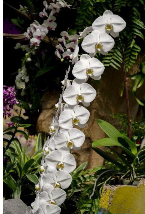
Phalaenopsis Sogo Yukidian

This beautiful moth orchid has a long inflorescence of large, white flowers. The origins of the hybrid's ancestor species can be traced to Brunei Darussalam, Indonesia, and Malaysia. It is reminiscent of Phalaenopsis amabilis , one of the national flowers of Indonesia